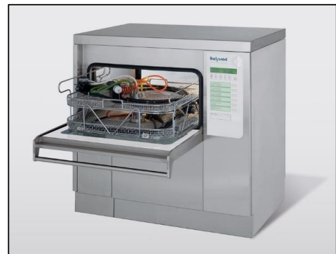
Example Endoscope Washer

"Thanks to Angst+Pfister Sensors and Power, we were able to massively improve our process stability and repeatability"