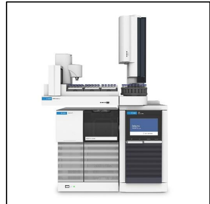
Example GC

"Thanks to Angst+Pfister Sensors and Power, we were able to massively improve our process stability and repeatability"